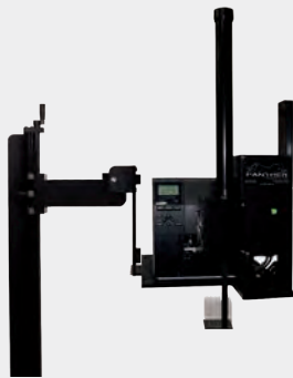
Top Apply-Optional Stand