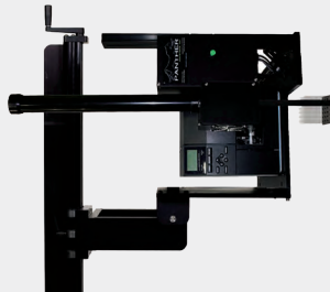
Side Apply-Optional Stand